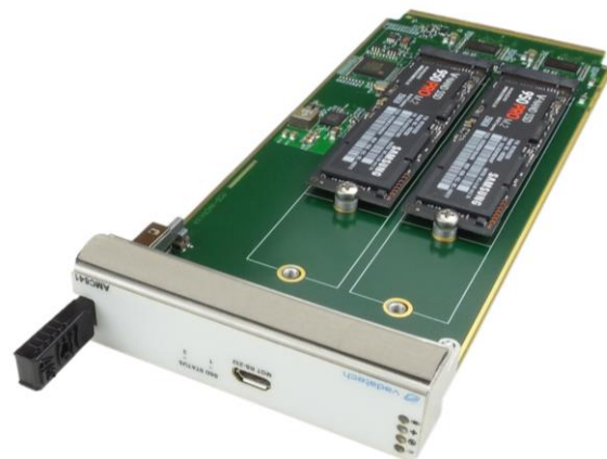
Figure 1: AMC641

The AMC641 is available in both air-cooled (MTCA.0 and MTCA.1) and rugged conduction-cooled versions (MTCA.2 or MTCA.3, contact sales for details).